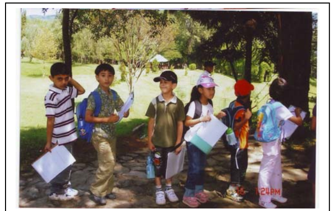
Students at the field trip